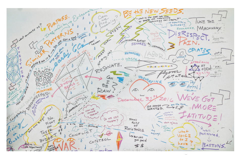
Figure 1. Student volunteer Layne Hubbard's drawing of the themes from the "Going Rogue" table.

In our "rogue" group (Figure 1), we spoke about our own experience as researchers with ambitions to make positive change through, yet beyond, academic life. We spoke about contradictions in the desire to design tools for better living, with the nagging acknowledgment that any tool can be made to work against fairness and respect, and that all new production of software and hardware sequesters resources (and, thus, futures) from others. We talked about the need to be mindful of life in other parts of the world and in times to come—and to