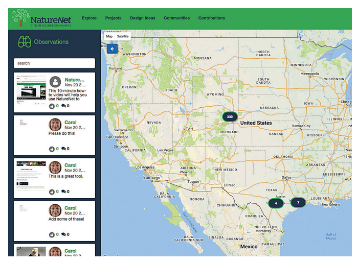
Figure 2. The Explore screen of NatureNet showing contributions, including thumbs-up ratings and a symbol indicating a design suggestion. A map indicates the number of contributions from different localities. (https://www.nature-net.org/explore)

Anacostia Boat Tour Capstone Scheduled for September 23, 2017, this boat tour focusses on preservation and impacts of stormwater on the Anacostia Soliculated to deprince 20, 2017, inside documents of the learning inversion Maryland. This capstone by Ltz will involve 20+ participants in adding content to NatureNet as part of the learning process during the 2 hour tour. See http://watershedinfo.umd.edu/ for more information about the watershed. Recent Contributions