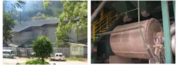
Fig.2. Copendos, Costa Rica coffee drying process [79].