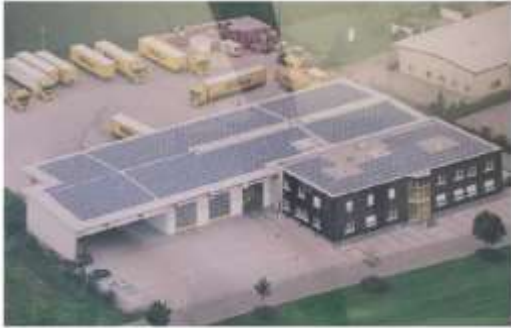
Fig. 4. Washing demonstration plant in Austria [95].

Washing processes require a bulk of warm water, which provides an excellent opportunity to use solar thermal energy in practically all commercial sectors like bottles, barrels and containers in the food industry, metal parts and varnishing, galvanizing and enameling surfaces, and textile industry, business enterprises, laundries etc.