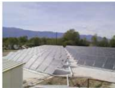
Fig. 3. 706 kW solar thermal plant in dairy industry in Greece [94].

Table 7 illustrates the main industrial application areas where a solar pasteurization or a solar sterilization system is already in use, their key features, solar collector information and also operational temperature data.