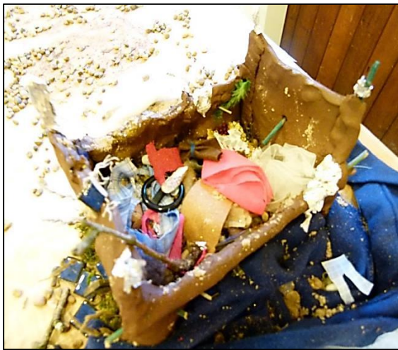
Figure 3. Group model of ‘the skip of memories’

Roadside skips (Figure 2) were a recurring feature, particularly in Staines, and emerged in the workshops as a powerful talking point connected to loss, waste and value. They symbolised for many how treasured possessions became soiled and dumped, along with the memories that went with them. Jodi, aged 14, talked about how “the skip of memories” that her group modelled (Figure 3) “shows the destruction the floods left.... It shows all people’s memories and all their, like, precious things that got ruined”.