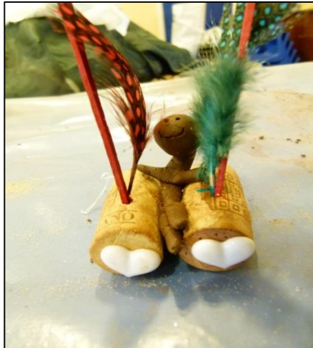
Figure 6. Richard’s model of a raft

“It’s a little raft and there’s a person sitting on it. They’re all prepared... They didn’t realise that it would have ever flooded but now they realise that it will more than likely flood again, so they’ve bought themselves a little raft that I made... Because it’s happened before, it can happen again. They’re adapting...”