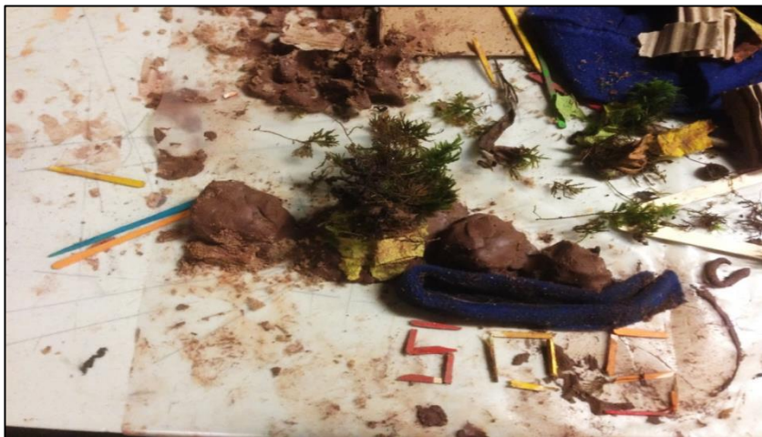
Figure 5. Ruth's model signals 'SOS'

In these ways, children were seen to find the flood experience, from the day of the flood through the long recovery period, not only isolating but alienating - a feeling underlined when they found that friends, schools and local authorities failed to notice what they were going through, and consequently were unable to provide support.