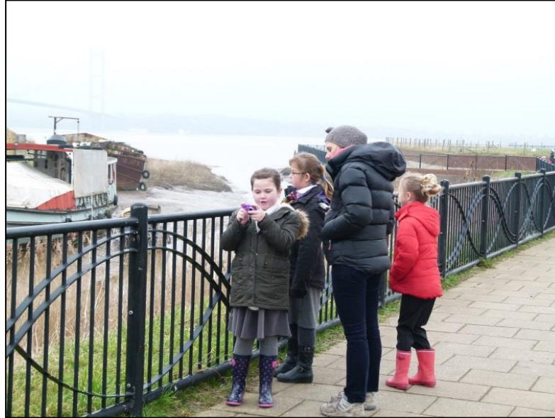
Figure 1. Walking and photographing the local landscape

Data collected during workshops included: photographs; video and audio recordings of walking and phototalk sessions; group discussions during sandplay, 3D modelling and theatre activities and interview transcripts. Audio recordings were transcribed. This multi-media material was coded and categorised thematically in research team meetings and organised using Atlas.ti software. Emerging themes were taken back to the children for discussion and to support the development of their later presentations to stakeholders and creation of their Flood Manifestos for Change.