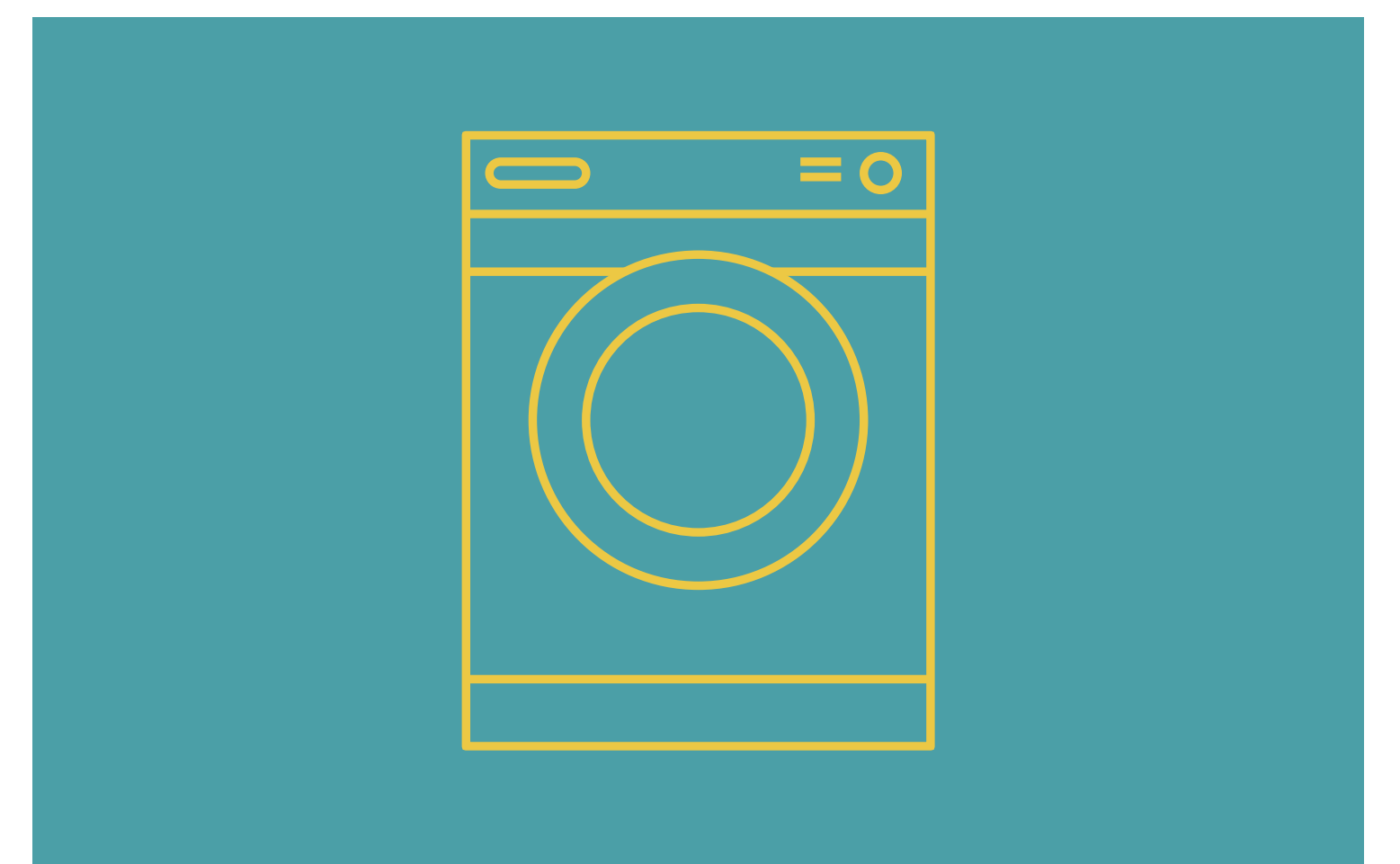
Appliance ecosystem with energy temporality by design.

With over 450 appliances already on the market, a VAT rebate on your first three purchases, and appliances so capable they required a brand new European efficiency classification to be created, this DirectWire ecosystem is growing fast.