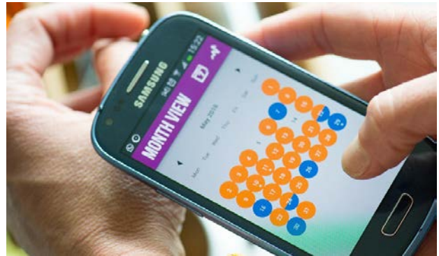
Figure 1 SnAPP data capture and visualisation platform

Each submission will be assigned a DOI string to be included here.