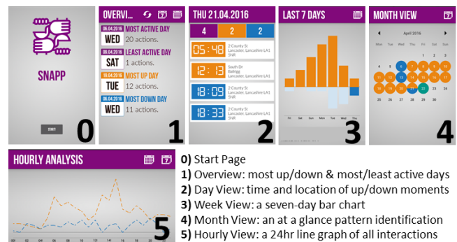
Figure 3 SnAPP data visualization: start page & 5 data views

Wass and Porayska-Pomsta [44] indicate how valuable technology can be for individuals with autism particularly as it is logical and predictable. However, such systems can also be too rigid and prescriptive, as currently available therapeutic tools seem to be programmed with intended outcomes around cognitive training. In doing so they are intended to ‘teach’ people something rather than supporting them to apply their knowledge. Research [44] has also found mixed outcomes in relation to technological cognitive training programs such as Computer based CBT