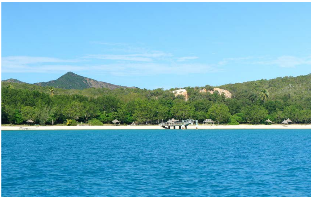
Figure 3: Mouac island

Two issues seem to have led to the withdrawal of these cruise visits. One concerned alleged misappropriation of committee funds, while the other concerned the existing land conflicts over Mouac. In any event, the women of Titch are still disappointed with the shutdown, which gave them some income. Whatever the truth of the land tenure issues, the claims to Mouac seem to conceal economic interests in the potential profits from the cruise ship visits.