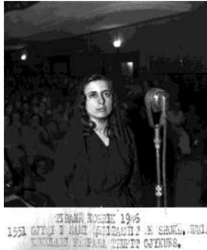
Figure 3. Musine Kokalari at her 1946 trial held at Rex Cinema