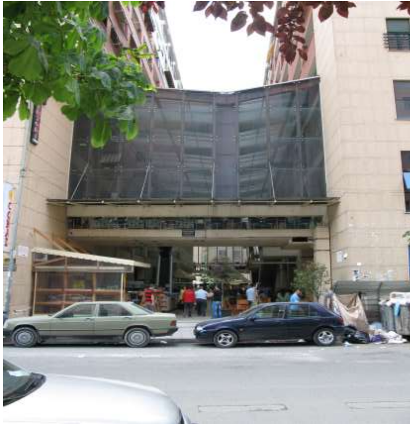
Figure 1. Photo of shopping centre, Tirana, May 2015