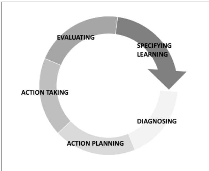
Figure 2: Susman and Evered's five stages of action research (1978)

This cyclical process of 'thinking and doing' things differently helped us in making design choices that ensured a constant focus on action while always remaining grounded in our theory.