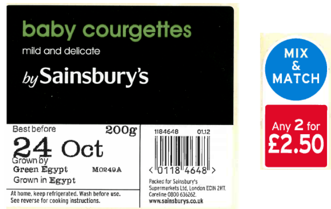
Figure 2. An example of a product label.

In Block 1, all of the participants adopted their own idiosyncratic approach to label checking, having received no specific instructions about possible strategies that might