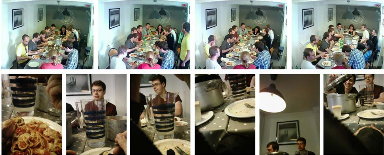
Figure 5: Infrastructure camera photos (top) vs. wearable camera photos. All participants have given consent for publication of these photographs.