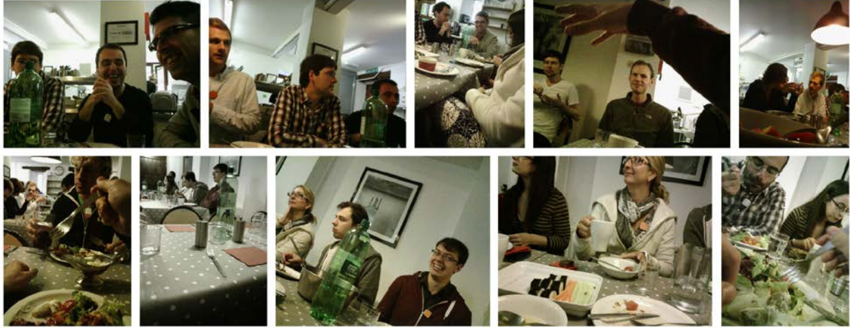
Figure 3: Examples of ten different perspectives on an event as captured by the participants' wearable cameras. All participants have given consent for publication of these photographs.