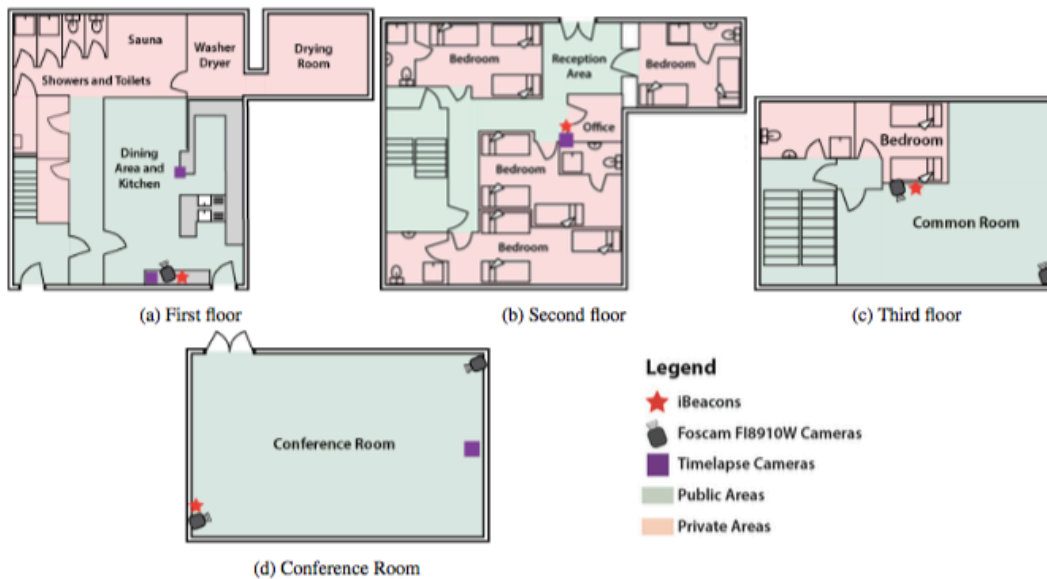
Figure 1: Hostel floor plan. Bedrooms were located on the second (b) and third (c) floor, and shared social spaces on the first (a) and third (c) floor. Areas marked green were recorded throughout the study; red areas were deemed “private”.

During the 2.75 days of study, participants engaged in a variety of tasks following a prepared schedule; this allowed us to assemble a wide variety of lifelogging data in order to understand the challenges collecting and analyzing data from different everyday activities. Household tasks (e.g. cooking, eating, cleaning) were supplemented with additional activities such as hiking, jogging, meetings, and workshops.