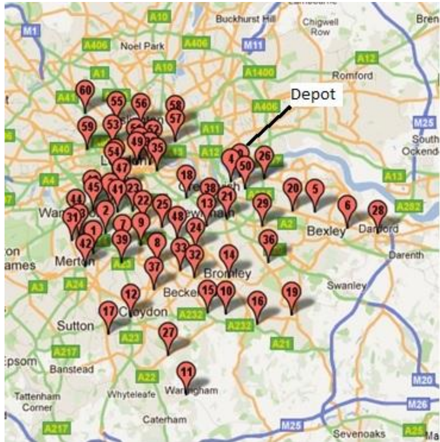
Figure 1: Customer and depot locations

Traffic information was supplied from ITIS Holdings. From information obtained by tracking fleets of vehicles in the area, observations of speeds were obtained for all road segments. The 24-hour period during a weekday was divided into 15 different time slots. Within each time slot the observed speeds were relatively stable, but speeds could be very different in different time slots due to the way that traffic congestion builds up at different times of the day. For each road segment, the mean speed in each time slot was taken to be the maximum speed that could apply to any vehicle starting to travel over the road segment within that time slot.