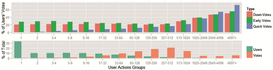
Fig. 1. Top: Percentage of a user’s votes which correspond to the three ‘expert’ voting behaviors. Bottom: Percentage of total users and votes for each activity level group.

The most active voting users diverge from their less active peers by the frequency of their votes, but also by the nature of their votes – to the extent that they can be considered a class of voting ‘superparticipants’ [14]. These voting superparticipants are more likely to cast down-votes, are more likely to vote on fresh posts (first 20 votes cast on a post) and are more likely to vote quickly (voting within 10 s of their previous vote). Figure 1 shows the prevalence of these behaviors in user groups defined by activity level.