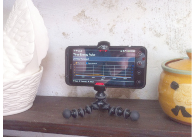
Figure 1. Tiree Energy Pulse located device.

In modern times we are used to an electricity supply system which allows us as consumers access to as much energy as we want, any time we want it for relatively low cost. Much of this electricity is sourced from burning a carbon rich diet of coal, oil and gas which has fuelled industrial development and economies. The future of this energy supply is looking rather less reliable. Borrowing from M. King Hubbert's peak