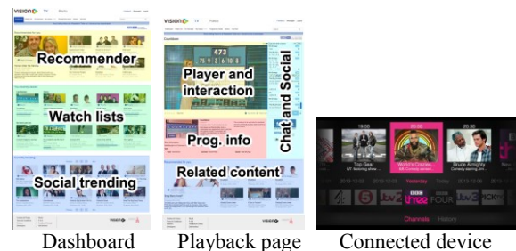
Figure 1 Web interface and connected device

The statistics service of Vision is the core component that offers the ability to track user's interactions with each other and with the Vision content service in fine-granularity for comprehensive data analysis. The report engine resides in user devices to catch predefined and time-codec events such as playback requests or status information, pre-process the data and report to the stats ingest service .