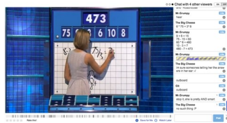
(a) Chat module

messages to be replayed when a TV programme is watched as on-demand content at a later point. By doing so, Vision not only captures the live TV content but also the associated user viewing experience, despite the actual age of the content. To further improve the user experience in the captured live atmosphere, we also allow chat messages to be given during on-demand playback allowing the social atmosphere to further develop beyond the time span of live events. Furthermore, the chat feature is accompanied by a heat-map, which labels messages associated with the content in a timeline (Figure 3). The heat-map assists Vision users to efficiently navigate between “hot” social moments of on-demand content.