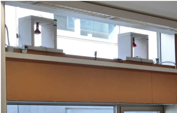
Fig. 1. Snapshot of the testbed infrastructure available at TU Graz taken remotely using the steerable Web-cam.

demo session to capture how link quality degrades at high temperatures. Specifically, we will use four Maxfor MTM-CM5000MSP wireless sensor nodes of which two will be heated using infra-red heating lamps similar to the ones shown in Figure 1. The demo will show how the dependency between temperature and link quality can be determined in real-time by measuring temperature and signal strength information.