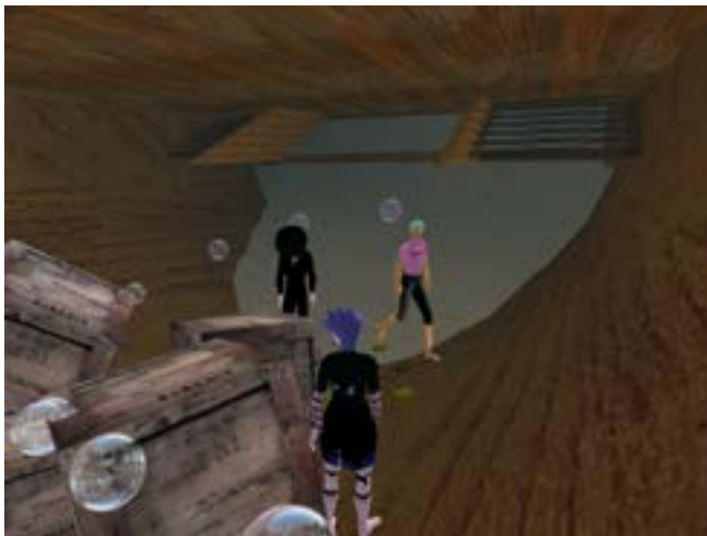
Figure 2. Snapshot from 7 Mar 2008.

In future work I intend to adopt a systematic approach to the analysis of my data. A possible beginning