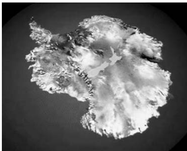
Fig. 2. 'Illuminations' by Anne Noble. The map is part of a series that critically investigates the place of maps within New Zealand popular culture. Noble was an Art Fellow with the Artists programme. Reproduced by courtesy of the artist.

These kinds of rhetorical gestures (while occasionally geographically suspect) provide evidence to contemporary policy and visceral investments in Antarctica. Thus it is unwise — as Belich (2001) and Bell (1996) do — to