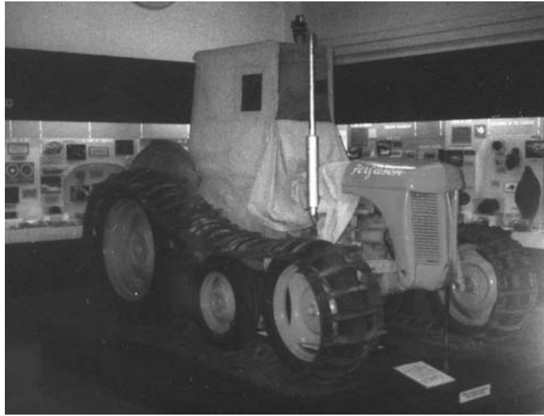
Fig. 3. Sir Edmund Hillary's tractor from the Commonwealth Trans-Antarctic Expedition (1955–58). It is exhibited in the Canterbury Museum in Christchurch.

all) historic and contemporary Maori connections to the Antarctic and Southern Ocean.