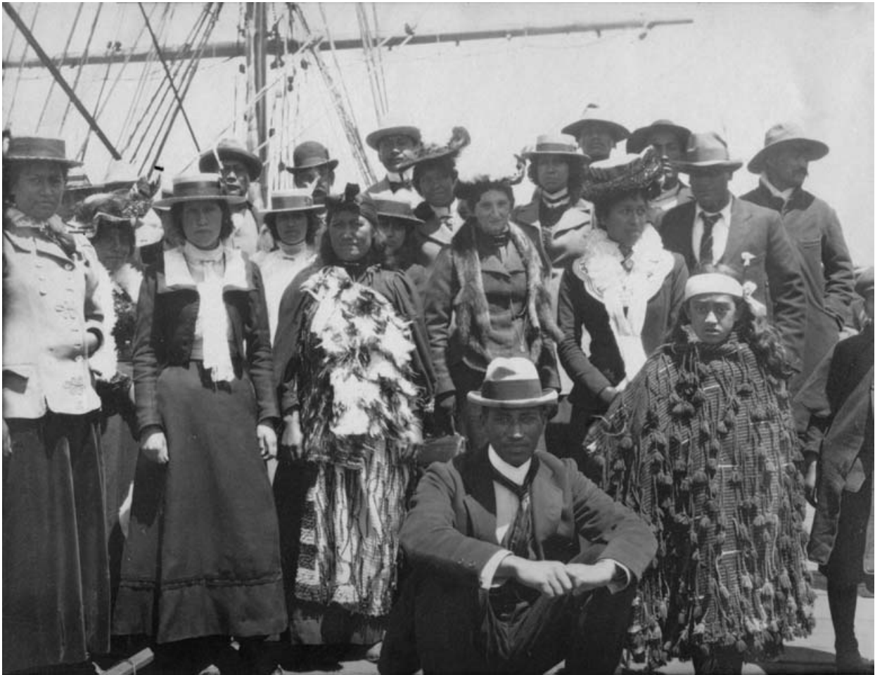
Fig. 4. Maori visitors on board, Lyttleton (c.1901–04).

(Fig. 4). The return visits from Maori to Discovery were recorded in photographs in the Royal Geographical Society photographic archives. Wilson recorded: