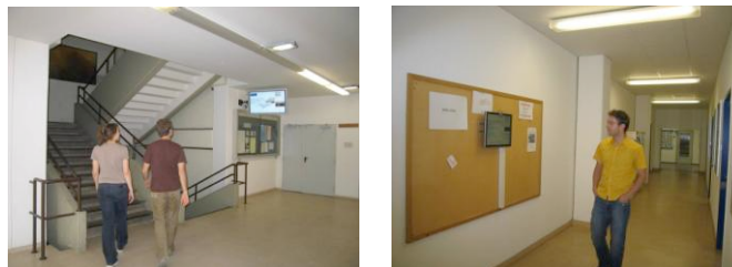
Figure 1. The Munster iDisplay System.

The Munster Situated Display System (see figure 1) has been developed to provide information to faculty members and students of the Geoscience Department at Münster University. The current installation consists of seven displays of varying sizes, of which two are visible in the figure below (top left and bottom right). The iDisplay system has gone through a couple of prototype stages and consists currently of two different display types. The “news-board” version provides a good overview on new information and is designed to accommodate short viewing times (3-10 seconds). In contrast, the “reminder-boards” provide more detailed and personalised information. The current design choices are the result of a contextual inquiry, user observations and various interviews.