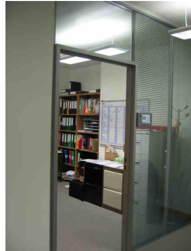
Figure 4. The Hermes II Office Door Display (taken March 2007).

The Hermes system was dismantled in July 2004 and working prototypes of a new version of Hermes (Hermes 2) were deployed in the new department building in May 2006. A full deployment across two corridors and 40 offices is currently being completed. From the user’s perspective, one significant change from the original Hermes system is the use of a larger 7 inch widescreen display. This larger screen was chosen by the majority of door display owners from the original Hermes system during a ‘show case’ study in which a variety of display options (based on high fidelity prototypes) were presented to previous owners.