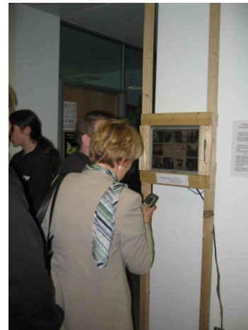
Figure 1. InfoLab visitor interacting with the Hermes Photo Display (March 2006).

A brief user trial was carried out in March 2006 (see Figure 1 below) in which the system was used in an unprescribed fashion by a small number of visitors to the Computing Department. As you might expect, users spent some time matching up the grid pattern shown on their mobile phone with the grid pattern shown on the display, but users were able to complete selection and downloading tasks.