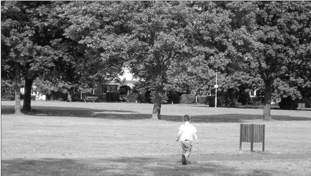
Ways of the stranger and of the citizen. Opposite page: Blake Road (note the transmitter on the lamp post on the right of the picture). Above: Wanstead Common.

inition'. 42 That is, recognition that alters the community allowing it to become something new, something different.