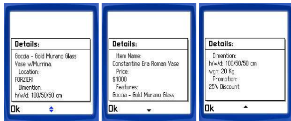
Fig. 2: Roman Vase Product Information

This advertising system allows customers to retrieve additional information about a product without having to relocate to the particular business advertising it; or to obtain information when the business might be closed as shown in Fig. 2. Once the purchase decision has been taken by the consumer, and -most likely- his friends and family, he can make the purchase remotely through General Packet Radio Service (GPRS) connection to the business's server through a secure payment mechanism. When the payment is received, the product will be automatically dispatched to the address registered with the payment details, unless the user specifies an alternative.