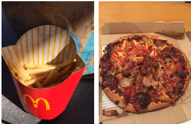
(a) Thanks again for the full fries! (b) Another perfect pizza from <user>!

There is yet another form of sarcasm prevalent on social media where users opt for accompanying text with images to express sarcasm. In these cases, the text conveys a meaning that contrasts the content of the image. Figure 1 presents an example where the text and the image taken individually are not sarcastic but paired together; they express sarcastic intent.