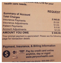
(b) Life is just going great this year so far for me.