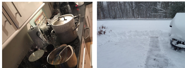
(a) What a joy to wake up the morning after thanksgiving dinner at the hatch flat !! (b) the nice thing is that after i get my driveway shoveled, i can start shoveling the road .

Later, Qin et al. [2023] enhanced the MMSD dataset by removing spurious cues. They point out that many positive