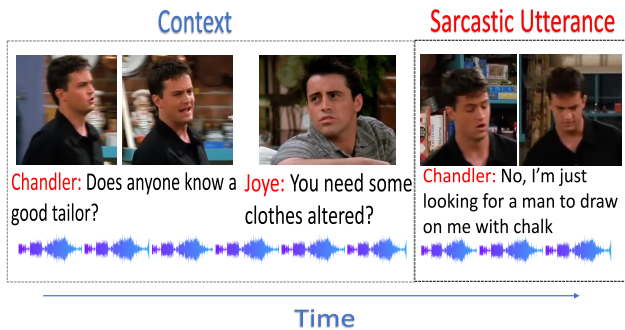
Figure 2: Sarcasm conveyed through text (dialogue), audio (tone), and video (facial expression). The context is important in these cases.

Additionally, humans can utilize their facial expressions and voice tone to supplement what they are saying in order to express sarcasm. In this case, video, audio, and text are all necessary to express sarcasm. Figure 2 shows such a scenario. In this case, the contextual conversation leading up to the sarcastic remark is necessary to appreciate the irony.