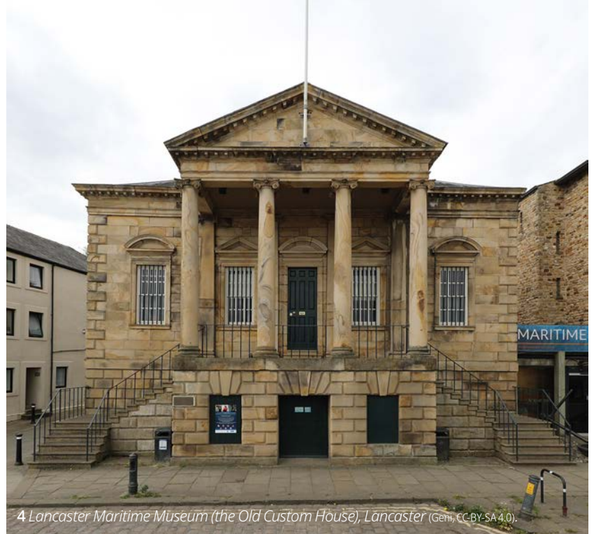
4 Lancaster Maritime Museum (the Old Custom House), Lancaster.