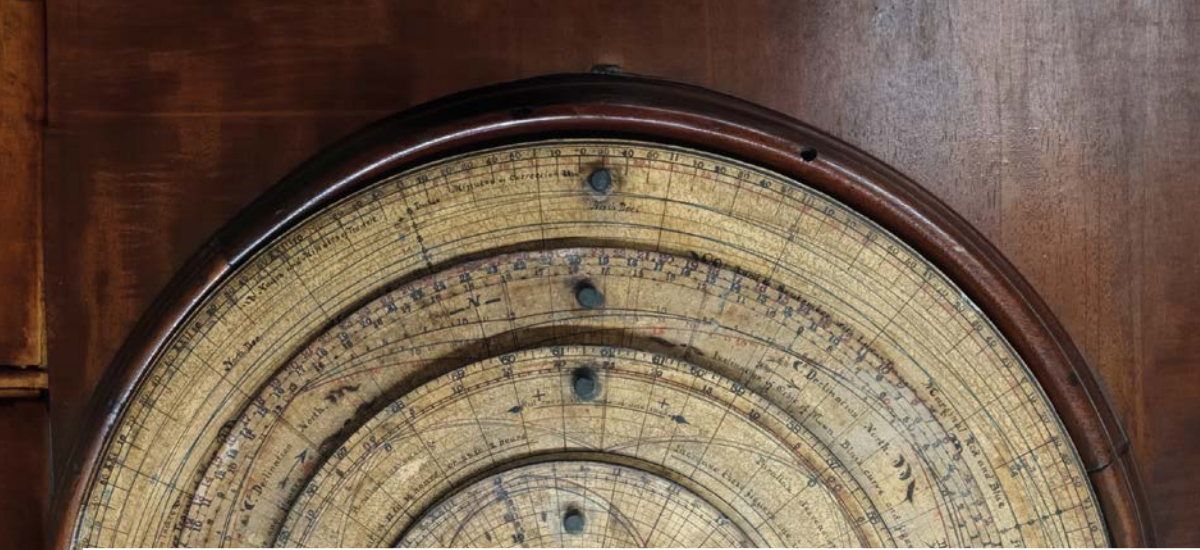
2 A close up of half of the 'kludonometric' transit device, showing all four discs