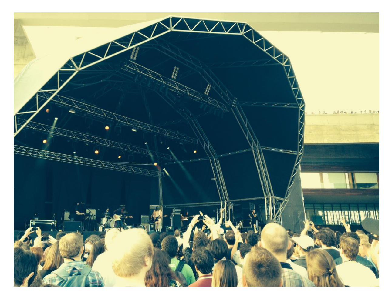
Figure III. The in-concert music experience

stage to another to see the next band perform. In festival terms, this is translated as the constant movement of people through the pre-designed festival paths, as evidenced in the previously cited supplementary video file. Attendees purposefully striding across the festival site might be parallelized as the embodied experience of alienation (Vidon & Rickly, 2018) in space, whereby festival attendees actually turn into busy individuals absorbed within the daily staged music routine of the festival. In an instrumental manner, they seek to experience the pleasures of participating in an endless, ongoing aesthetic gaze of music performances, across the duration of the festival, and across the diversity of the festival's musical spaces that are at hand (Featherstone, 1998).