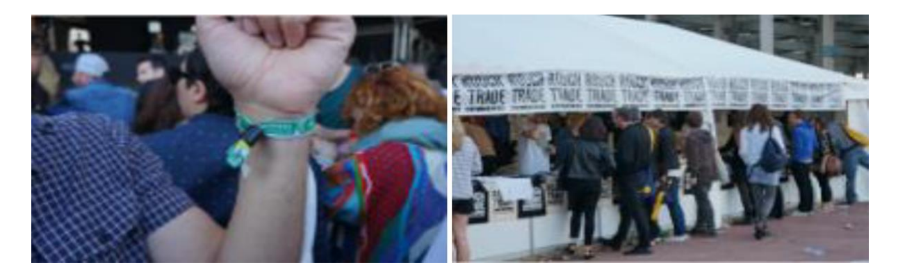
Figure I. Indie Music Aesthetics

These different levels give participants access to a diverse range of in-festival places. For example, those with press and professional status, including artists, can gain admittance to locations such as specially designed bars, shops, lounges and backstage areas where regular and VIP members are not permitted to enter. Objects such as the bracelet, festival booklet and goodie bag therefore serve to differentiate the festival experience and the symbolic status of festival attendees within the field of indie music (Coskuner-Balli & Thompson, 2013).