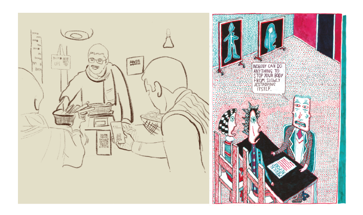
Figure 4: Left: A road-side merchant using digital payments for daily transactions, Digital illustration, Pranjal Jain, 2021; Right: We Hate You, Enormous Leering Skull (excerpt), Ink on Paper, John Miers, 2019 [8]. ©All artworks in this montage belong to the authors and are reproduced with permission.

Immediately after the workshop finishes we plan to host a small exhibition in an appropriate area within the conference venue (in conversation with the workshop and general chairs). The workshop organisers will request the use of a small number of poster-boards to facilitate presentation. This in-CHI exhibition can be hosted both within the physical venue and digital space for all attendees to explore. When the physical imagery is removed, the online exhibition (hosted in Mozilla Hubs) will remain as a legacy of the event. We also plan to form a working group and network whose aims are to raise awareness of the complementary and investigative nature of arts practice, and produce outputs that challenge existing publication genres. Finally, we will create a digital/physical artists' book in the style of a gallery catalogue – de-centering text and celebrating the artists' creation from the workshop. This will be made open access and available for download and print.