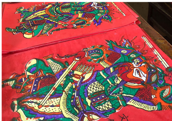
Fig. 6 Door God Woodblock prints.

To enhance cultural self-confidence through ICH activities, China has implemented two strategies – 'creative transformation' and 'innovative development' –