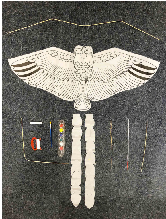
Fig. 7 Kite kits used for teaching

bamboo sticks into lightweight careful profiled rods has been replaced by mass-produced bamboo sticks of uniform profile. Silk and paper for traditional kites have been replaced by waterproof plastic sheet, which is more robust and prevents the kites being damaged when taken out in the rain. In last 2 years, she has taught about 15,000 students this simplified version of traditional kite making (Fig. 8). Similarly, other inheritors we interviewed also spend time teaching for non-commercial reasons. Specifically, in the cases of A3 and A7,