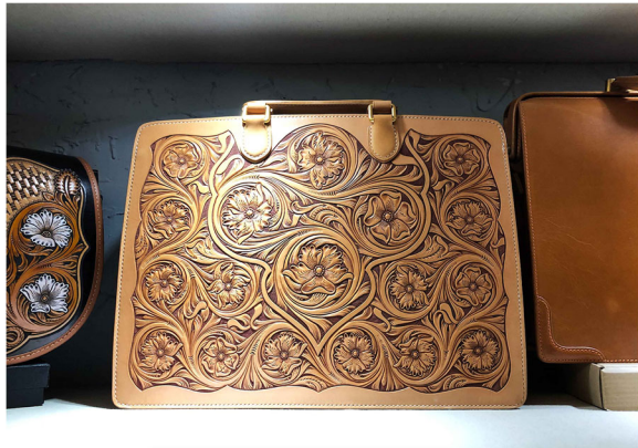
Fig. 4 Leather hand bag with intricate carving

strength and acoustic properties. Following selection, there is a long period dedicated to wood treatment. For example, in the case of A5, high quality Tung wood (a deciduous tree often grown for its oil) is an important material in the making of the Ruan, however, before it can be used in instrument making it has to be dried over a long period.