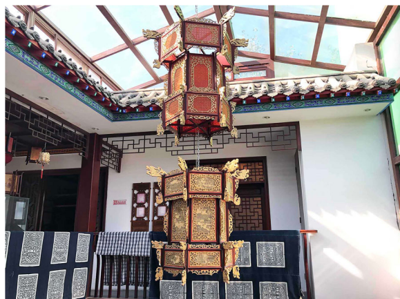
Fig. 1 Traditional lanterns are exhibited in a museum which was refurbished from inheritor Juntao Zhang's ancestral house, Kaifeng, China

A sense of responsibility to continue the tradition When inheritors were asked about their motivations for continuing these practices, the concept of responsibility was frequently mentioned – a strong sense of responsibility to continue the tradition. This was especially the case when they had been designated as an ICH Inheritor at the national, provincial and/or municipal level. A10 described a significant change when their family's ceremonial lantern making business was included in the list of China's national ICH: