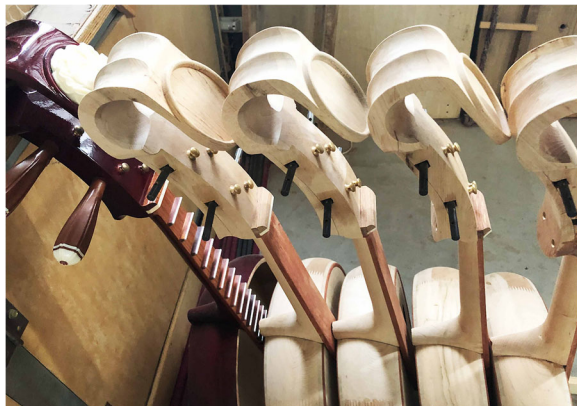
Fig. 5 Ruan musical instruments co-made by several craftspeople

Production The craft practices we studied usually had a small-scale of production (less than 10 people). Four of our interviewees were sole makers, (A1, A2, A3 and A10). A1 and A2 chooses specific customised orders for producing kites, such as orders for the old-style kites that appear in Chinese historical dramas or movies, and also miniature kites that are framed by collectors as art pieces. In the case of A7, A8 and A11, a family-based production model is adopted. A11 works with his father to make iron farm tools and knives in busy periods. His mother and his wife