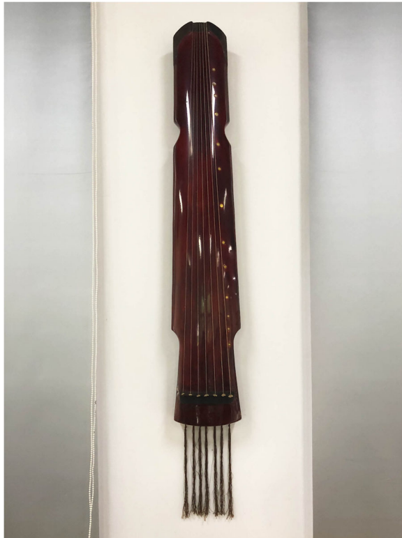
Fig. 2 The Guqin musical instrument

In the case of New Year woodblock prints, the prints themselves are relatively inexpensive. However, the craft skill, in the form of woodblock carving, is highly