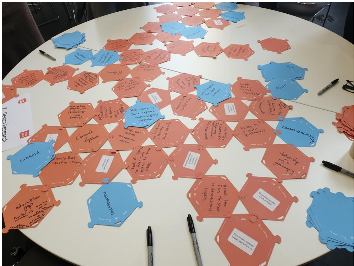
Figure 2 Mapping of challenges and clustering into themes during the workshop

The workshop took place at the Manchester Metropolitan University, where the IASDR 2019 Conference was hosted and it involved 8 participants with expertise in conducting design research in the Global South.