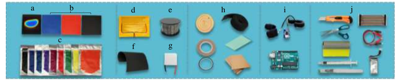
Figure 1: ThermoPixels components: a) liquid crystal sheet b) rub-and-reveal sheets c) thermochromic paints d) heating pad e) nichrome wire f) conductive fabric g) Peltier element h) insulation materials i) GSR sensor and Arduino and j) support tools

Miquel Alfaras PLUX Wireless Biosignals Lisbon, Portugal malfaras@plux.info