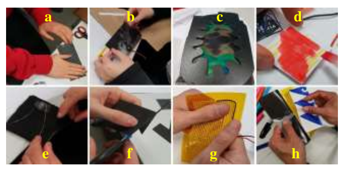
Figure 3: a-d (thermochromic) and e-h (heating) materials

using a brush and trying out different colors: "the painting is very fun; you heat it then it goes from one color to another or go to clear. That's a lot of fun" [P18]. They even engaged in combining them in different ways by juxtaposing or painting them side by side on paper, or by mixing the color first and then paint the new combined colors to watch their actuation. The change of color through the actuation of thermochromic paints tended to be slow, involving uneven color patterns with blurred boundaries, of limited brightness and resolution (Figure 3d): "I loved how the color changed and moved over. That was really organic and beautiful" [P10]. Thermochromic materials offer arguably a particularly embodied exploration as their actuations could be triggered by the body's temperature, visually experienced as having an aliveness quality and perceived as aesthetically pleasing.