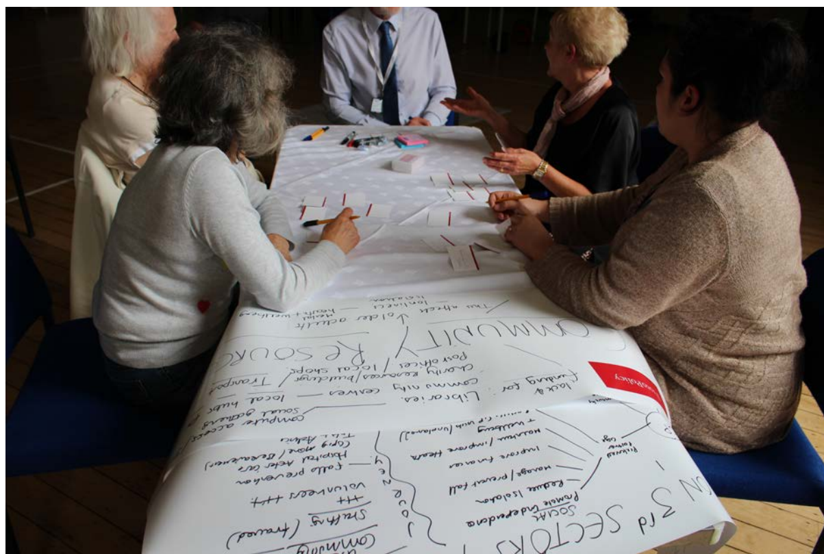
Figure 1. Workshop participants developing speculative design concepts for ProtoPolicy

ProtoPolicy included two co-design sessions; a half-day workshop with 14 participants living independently and a 2-day workshop with 7 participants, living in sheltered accommodation (see Table 1). The workshop insights and co-designed speculations were translated into a series of Design Fictions. This was achieved by analysing and coding the captured data and then crafting the provocations, by thematically sorting the participants' insights and giving consideration to the areas of contention that might be exposed in debate on an imagined future (Darby et al, 2016).