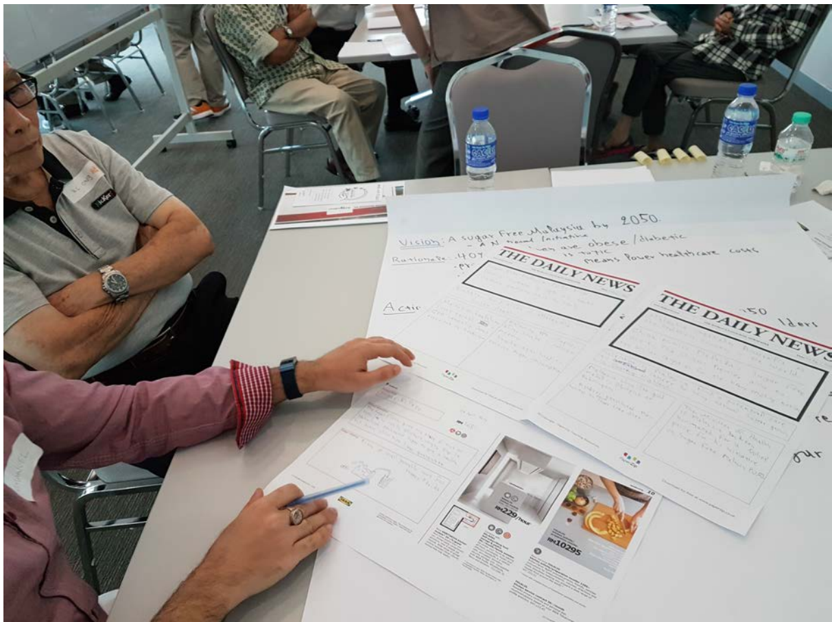
Figure 3. workshop participants developing on the 'Sugar-free Malaysia 2050' speculative design concept