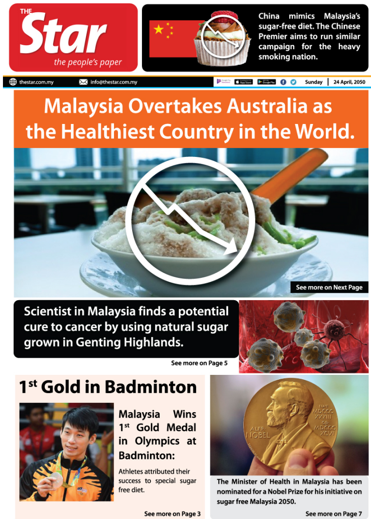
Figure 4. The 'Sugar-free Malaysia 2050' speculative design prototype

In working with policy makers from the Ministry of Women, Family, and Community Development, this project aimed to disrupt the usual top-down approach to policy-development that tends to be adopted to develop without sufficient consideration of the lived experiences of the intended beneficiaries and what they see as their priorities. Policy-makers were able to understand that the designing of a problem out of which they could prototype long-term policy-solutions was much more complex and requires a more systemic consideration beyond the identification of a policy gap. Senior citizens were given the chance to consider how they could bring their background knowledge and experiences to bear as situated experts, while playing the role of citizen designers to produce prototypical products/outcomes, which are then taken a step further. Since participants in the ImaginAging speculative design workshops were required to work in groups, which comprised of members with minimal or no overlapping backgrounds, the process means that not only do they have to learn how to think about problems and consider solutions in the form of design, they also have to learn how to communicate each other's perspectives and contributions into a coherent outcome.