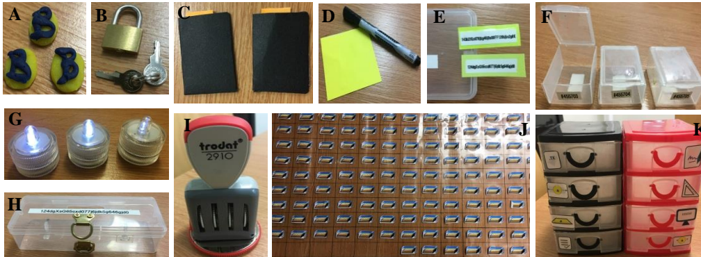
Figure 1: BlockKit-Representation of Blockchain's Entities: A- Bitcoins B- Wallet's password C- Private key D- Proof-of-work E- Public key F- Block G- Miners' hash power H- Wallet I- Timestamp J- Blockchain ledger K- Consensus rules

Design Informatics University of Edinburgh Edinburgh, United Kingdom c.speed@ed.ac.uk