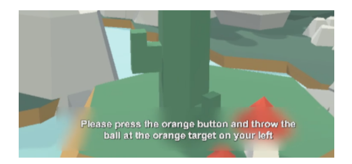
Figure 2: Background Blur blurs the background behind the subtitles when the user is gazing on the subtitles.

Through our evaluation, we gained knowledge about the current practice of VR subtitles. The results showed that depth conflicts for subtitles in VR applications is a pressing issue that can make subtitles unreadable and cause strain on the user. Eye tracking gives us additional information of if the user is reading the subtitles or where in the virtual environment they are looking and allows for the implementation of novel dynamic subtitle techniques that may increase the user experience. We present three subtitle techniques that use eye tracking in real time to address subtitle depth issues.