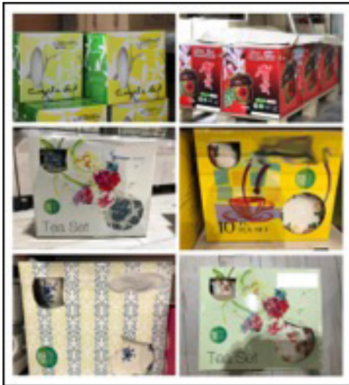
Figure 3 – Personalised packaging for festive seasons

Furthermore, the material for packaging is one of the significant attributes. The participants pointed out that the local consumers are not particularly concerned about the 100% local made, therefore, the corporation focuses on the cost of materials and its quality to enhance consumers' intention to purchase. The sustainability of packaging material has always been a consideration in the manufacturing process. Previously, the participants used plastics for the packaging and now they have changed by using recycled paper for the packaging. The participants are concerned about environmental issues and preferring non-toxic materials and processes, as well as maintaining profit. Moreover, the corporation is directing on sustainable business, minimal impact on environment and expanding the business into a global market, not only in Asia. In this sense, the manufacturers and designers use sustainable packaging material to attract consumers using the value of environmental responsibility and thus attracting to purchase the product.