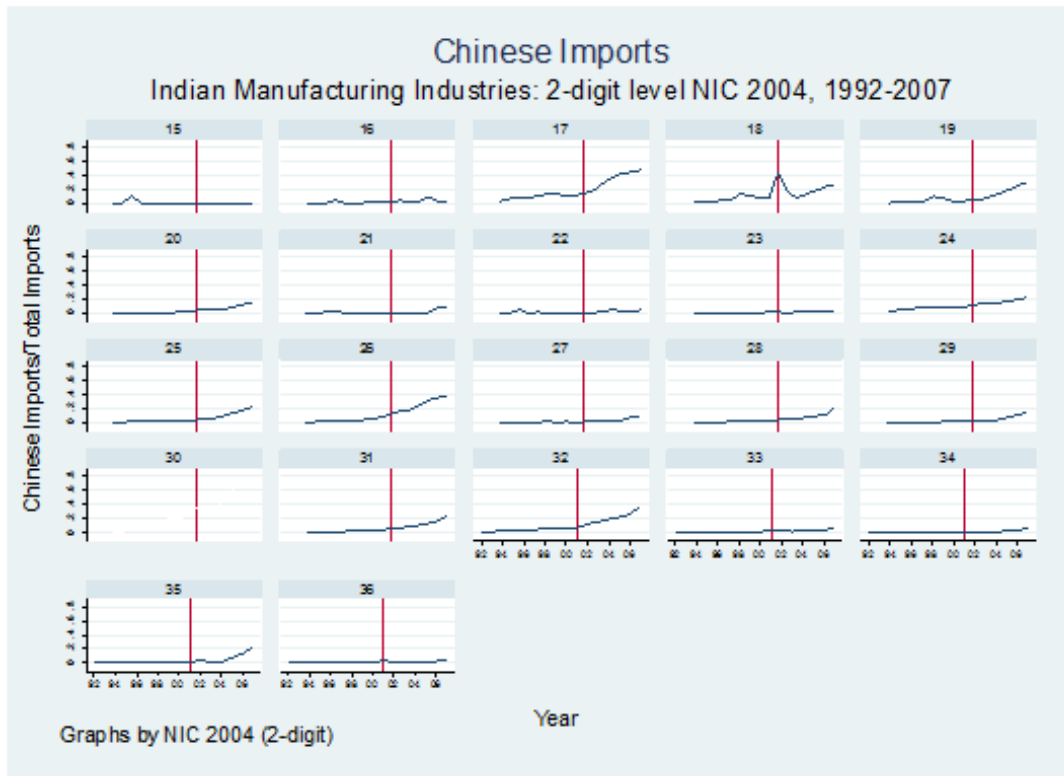
Figure 2: Share of Chinese Imports across 2-digit Manufacturing Industries, 1992-2007 Notes: Figures represent the average share of Chinese imports in total imports across each 2-digit manufacturing industry (at NIC 2004) in a given year.