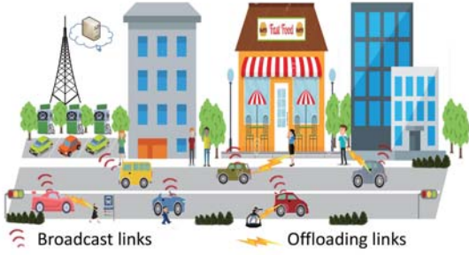
Fig. 1. The VFC resource allocation framework.

demand offloading. With a proper incentive mechanism designed by the BS, each vehicle can actively adjust the amount of sharing resources according to the reward in order to maximize its individual payoff.