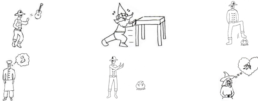
Figure 1. Stimuli taken from SdS. Extensional events are above; intensional below.

The set of stimuli, borrowed from SdS, consisted of 20 pictures of extensional events, and another 20 of intensional events, each event characterized by three crucial semantic roles: action, agent, and patient.