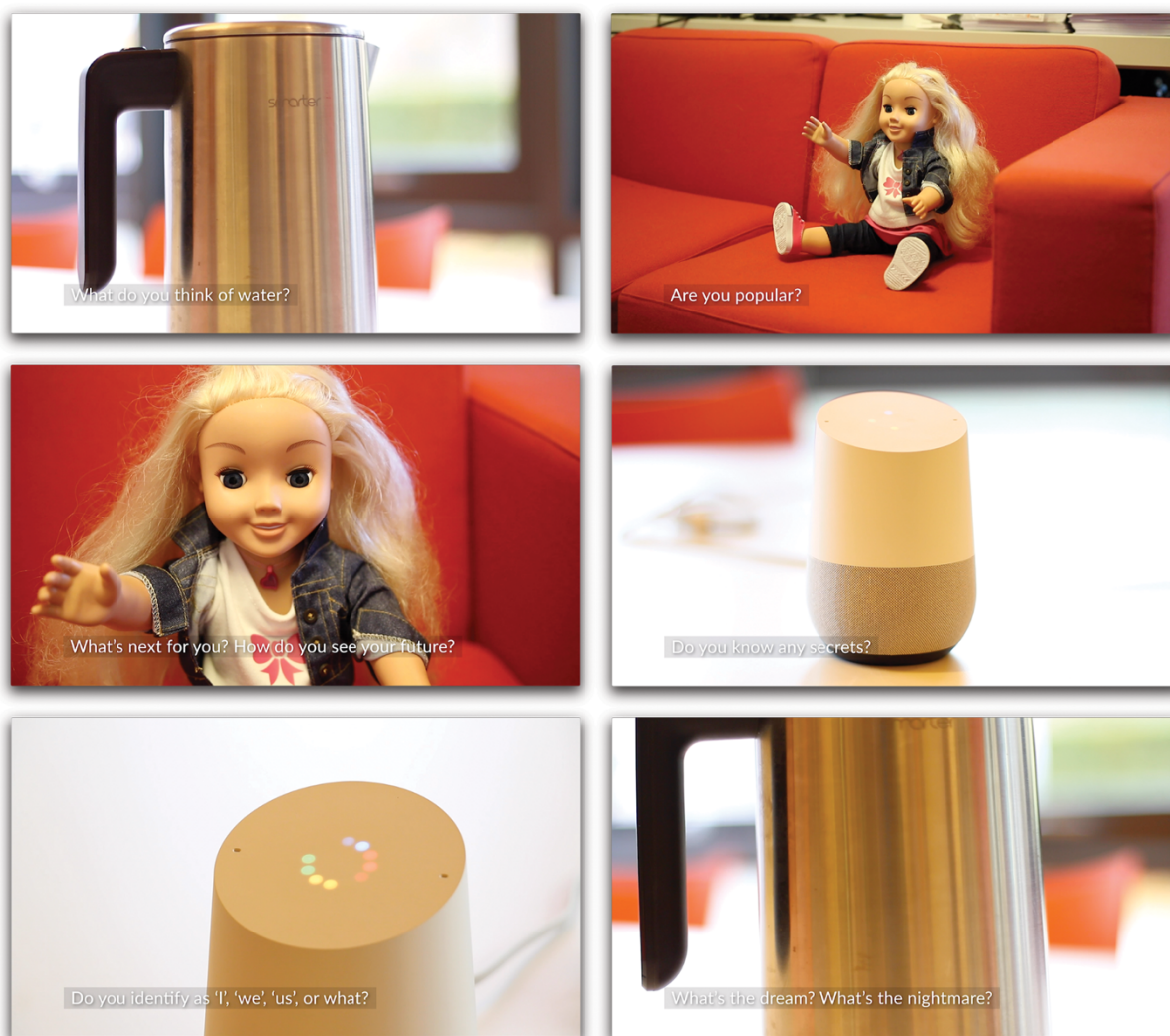
Figure 1. IoT devices used in the workshop as they appeared in a prompting video suggesting questions that one might ask them. Smarter iKettle 2.0 (top-left, bottom-right), Google Home (bottom-left, mid-right), Cayla Doll (mid-left, top-right).

exceptions the attendees had no particular expertise relating to the IoT, and they were given no information about the workshop beforehand other than it related to ‘ghosts’. At the beginning of the workshop participants were given a very brief introduction to OOO, Animism and the overall aim of this project. They were then shown a number IoT devices and asked to form small groups around the device they would like to consider. Each device was accompanied with some notes which were intended to help participants speculate about the device both in terms of OOO and Animism. Using the devices and the notes about them as stimuli, the groups were tasked with discussing the devices and trying to imagine—if it were possible to for the device to converse in the same way humans do—what questions it would be interesting to ask them. Some prompt questions were displayed on a video screen to aid in the imaginative process (Figure 1) and the workshop attendees were invited to extend their speculations to propose possible answers to the questions they were asking the devices.