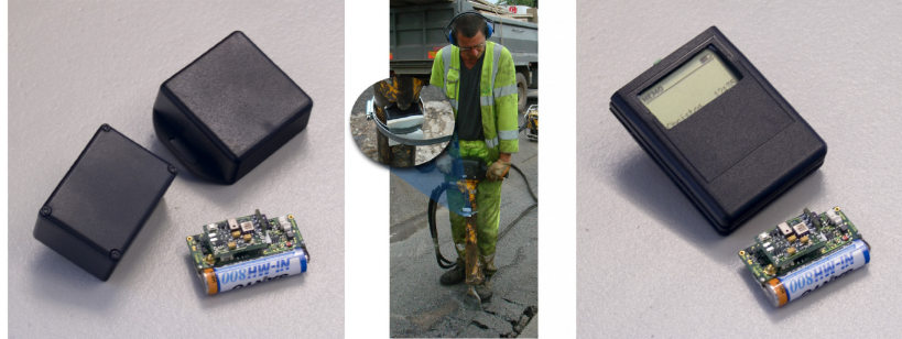
Fig. 3. Sensor-based vibration monitor system with wireless drill & dosimeter (reproduced from [7]).

We have developed a sensor-based vibration monitoring system that falls somewhat between the sensor-network and the artifact model. It consists of a heavy-duty pneumatic drill augmented with a wireless sensor node, and a wireless dosimeter that is worn by operators on top of their protective clothing (Figure 3). The drill measures vibrations using accelerometers, and the dosimeter records how often and how long an operative uses a drill. The dosimeter shows the user's current vibration exposure on a small display. Vibration exposure is estimated in cooperation between drill and dosimeter using information about the drill type and the duration of use. Dosimeters are personal devices: each operator uses his or her own device, yet the drill is shared among workers.