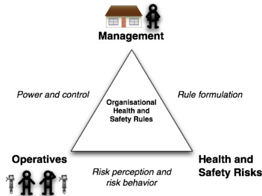
Fig. 4. Compliance triangle

issues are captured by the ‘compliance triangle’ in Figure 4, which highlights three areas: (1) power and control, (2) rule formulation and (3) risk perception and risk behavior. In the following, we will explore these issues in more detail. Furthermore we will argue that the underlying system architecture of a compliance system will have a profound effect on how a system fits in the organizational context and how it will be appropriated.