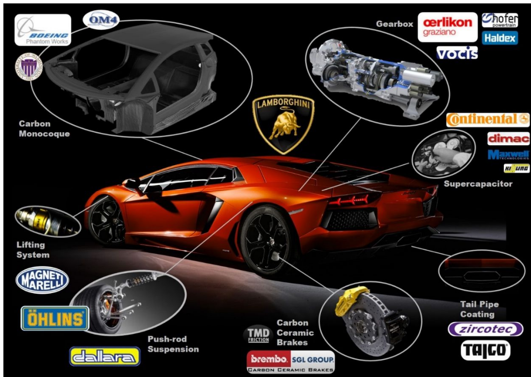
Figure 2 : Aventador embedded case studies components and companies