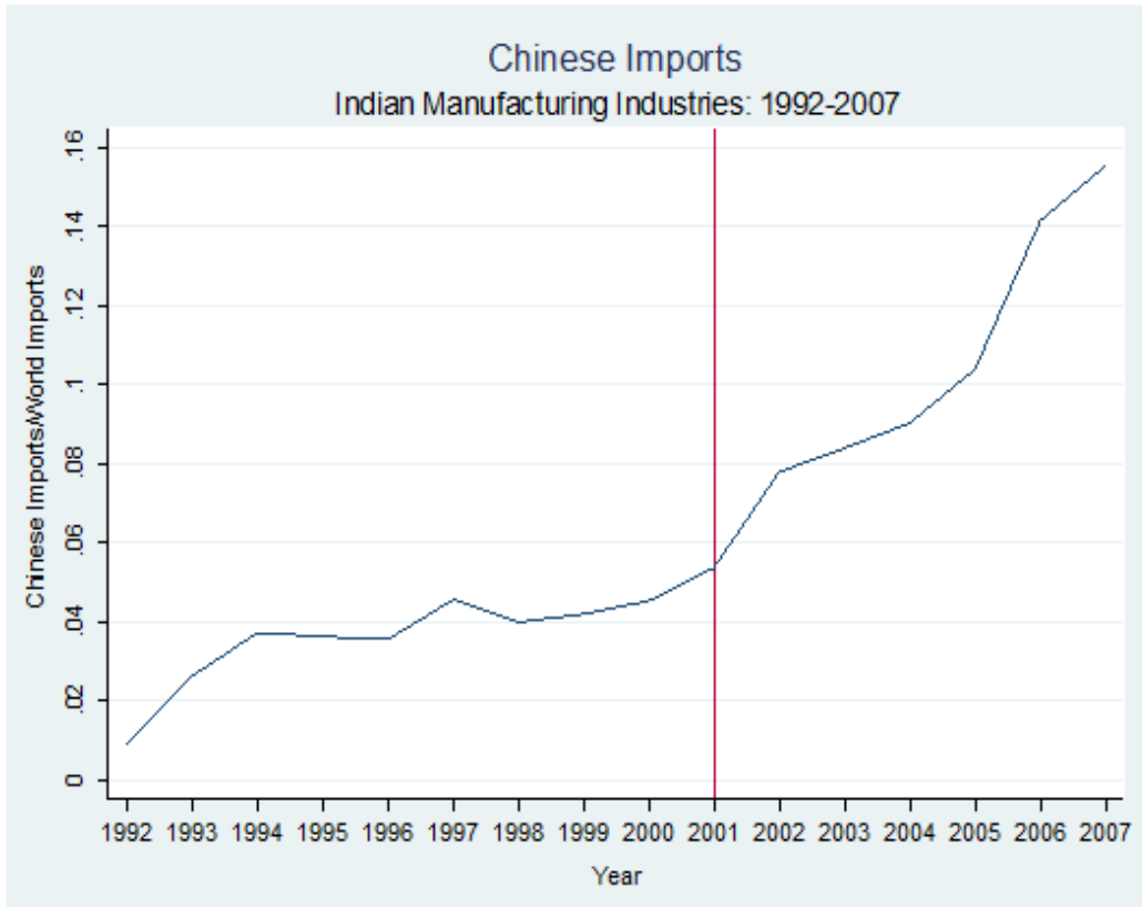
Figure 1: Share of Imports from China by Indian Manufacturing Industries, 1992-2007 Notes: Figures represent the average share of Chinese imports in total imports across manufacturing industries in a given year.