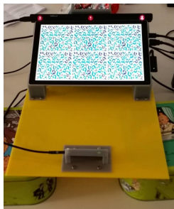
Figure 1: Data collection apparatus in a public space.

Centred on computing, decision-making studies either evaluate ways to assess or avoid indecisiveness, or explain what triggers it. For instance, detecting frustration is presented in [Alabdulkarim 2014] using sensors to detect typical hand features. Gonzalez [1996] investigated the role of animation in user interfaces in decision-making. The impact of the stimuli and potential distractors on the hand movement are analysed in [Chapman et al. 2010; Song and Nakayama 2009]. Our work spans through both worlds as we describe the gaze and hand behaviour that characterises decision-making.