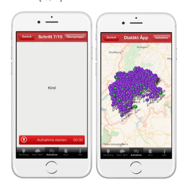
Figure 3: User prompt for word recording (left) and interactive map of users recordings (right)

They are given instructions regarding the recording process (see Figure 2, right panel), stating: 'Please record your voice in as quiet an environment as possible. Keep an approximate distance of about 15 cm between your device and your lips. Please articulate the text loudly and clearly in your own dialectal pronunciation'. They then record the 16 words shown on individual prompts (see Figure 3, left panel). Each iOS device from the first generation onwards has sampling rates of up to 48 kHz [10]. For the purposes of this study, 48 kHz are sufficient for reliable formant measurements, as is a sampling rate of 10 kHz [11]. After the recording process the raw wav files are uploaded on a server and tagged with unique IDs. The recordings then appear on an interactive map (Figure 3, right panel, green and purple pins). After releasing D\ddot{A} on 22 March, 2013, it was the most downloaded free app for iPhones [12]. Presently, it has >58,000 downloads, and its database includes c. 3,000 speakers from 452 localities across German-speaking Switzerland [13, 14].