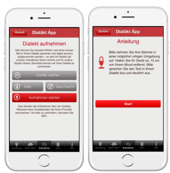
Figure 2: User interface for dialect, age, and sex selection (left) and recording instructions (right)

Dialäkt Äpp [9] enables users (1) to record 16 words and a short passage in their dialect and (2) to localise their dialect by choosing how they pronounce the 16 words in their SwG dialect. For the purpose of this study, we used functionality (1), introduced below. Prior to recording, the users of the app must indicate their age, sex, and dialect (see Figure 2, left panel).