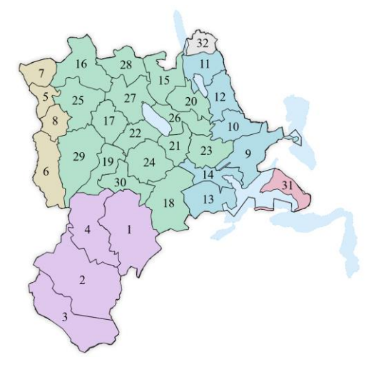
Figure 4: Localities and broader dialect regions as used in the current sample

Users who indicated a Lucerne locality to best correspond to their dialect served as subjects. 206 speakers recorded the word Kind and 210 trinken. Speakers ranged between 10 and 77 years of age (mean=30.1; median=26.5; SD=15.0), with 47.8% males and 52.2% females. Subjects originated from virtually every corner of the canton (32 localities in total), which we divided into six regions for subsequent analyses of diatopic distributions (cf. 3.1.): Entlebuch (EB), Hinterland (HL), Lucerne-Hochdorf (L-H), Midland (ML), Mount Rigi (RG), and Schongau (SCH). The division is based on Fischer's linguistic observations on the morphological, lexical, and phonological level [3]. For instance, EB and RG speakers show differences in vowel quantity; they articulate open-syllables such as the first syllable in jagen ('to hunt') as ['ja.gə], while the rest of the canton produces them with long vowels, i.e. ['ja:.gə], see Figure 4.