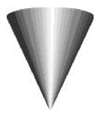
Figure 1: An idealised ice-cream cone.