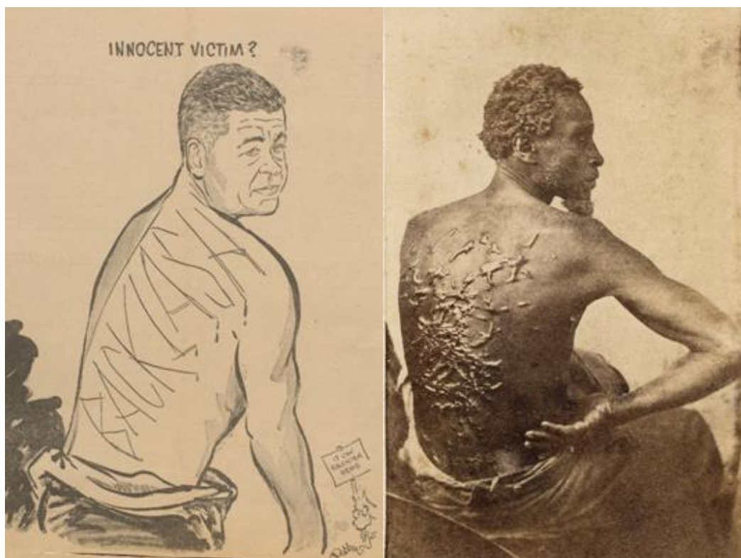
Figure 2. Fear of Backlash

Left: Edward Brooke, depicted in the Boston Herald, October 1966