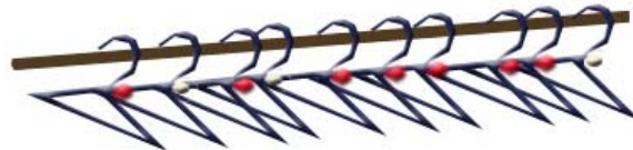
Figure 1: Design Sketch of the Hanger Display. Each of the hangers is augmented with a display element, and all hangers arranged on the rod together function as a coherent display.

From an interaction design perspective we think of the Hanger Display as being useful for portraying information that may be relevant to the activities involving hangers (such as hanging and selecting clothes, morning rituals, and getting ready for the day). For example, the hanger display could portray a sense of the day's expected high temperature: given a 0 – 100° F range, if 7 of 10 hangers were lit this would represent 70° F. However, the Hanger Display does not prescribe how information is mapped onto the variable collection of display elements; it is entirely open-ended for different display purposes. For instance, the hangers may convey any relative quantities (as in the temperature example), progress over time (e.g. in a reminder