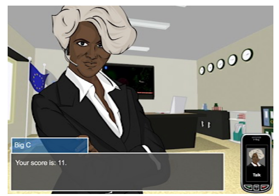
Fig. 3. Score Computed based on the Weight attached to Player's Answers in the Game

Seamless Evaluation [17] has been defined as an evaluation embedded through the educational content in such a way that is not intrusive to the user. The extension presented here would allow the authors to create a summative assessment, by