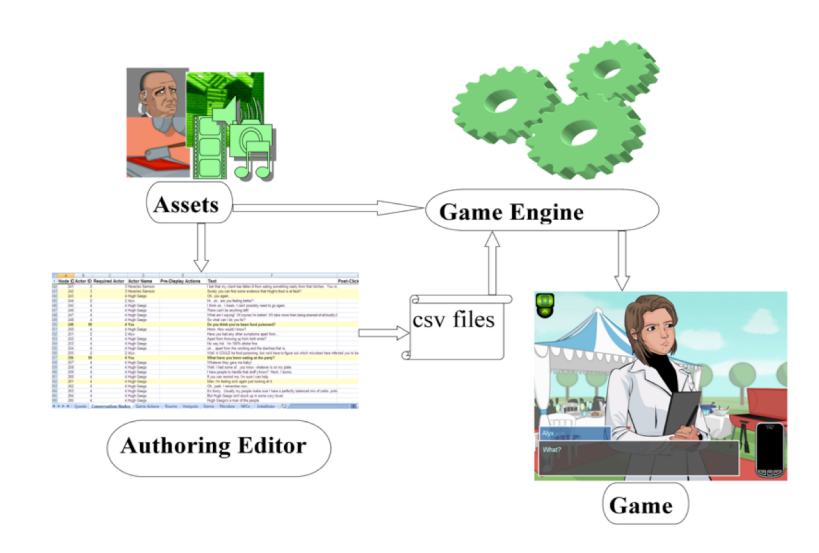
Fig. 1. Edugames4all Authoring Environment and Game Engine [2]