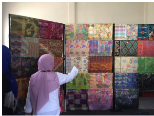
Figure 5: An entrepreneurial weaver shows her songket fabrics at her home which is also her workshop.