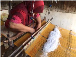
Figure 2: A home-based weaver is weaving songket on a handloom.