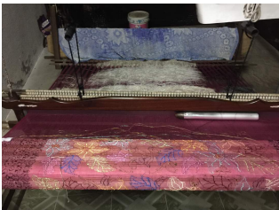
Figure 3: Partially completed songket on a handloom.

miliar context, and has provided the main source of income to many women in rural areas [9]. As most Malay people continue to wear clothes made of songket fabric (Figure 1. Note: all photos in Figure 1-5 are credited by third author) during special occasions, such as wedding ceremony, religious festival, social and national functions [9, 14], and the fabric is under much demand. However, the traditional songket weaving skills are increasingly endangered due to rapid economic development of factory-based weaving. The industrial textiles utilize jacquard loom with punch card [2], for mass production. The intense manual labor of home-based songket handweaving on handlooms (see Figure 2 - 4), and its limited income is providing less incentive for the younger generations to inherit these skills [9]. A few homegrown songket weavers have also started to adopt computer-aided technology for songket design, such as Microsoft Paint [14].