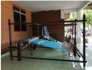
Figure 4: A bulky songket handloom is usually placed at weaver's home.