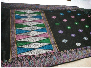
Figure 1: A songket fabric.