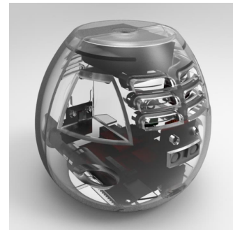
Fig. 3: The “IoT Egg” sensing device.