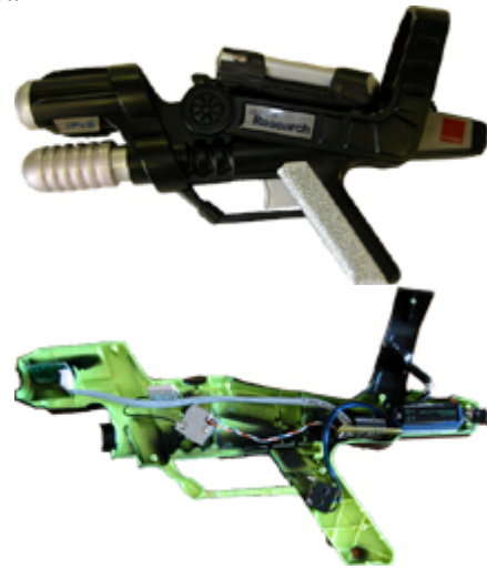
Figure 2: (a) A complete handset with iPAQ; (b) Cut-away view of a Super Soaker XP70 showing GPS, compass, trigger and battery.

The Real Tournament handset (Figure 2) is a modified Super Soaker XP70 water cannon augmented with a Trimble Lassen™ SQ GPS module, a electronic compass, two micro-switches (used for firing and utility selection), a Smart-Its sensor board [13], a Bluetooth enabled Compaq iPAQ Pocket PC with Compact Flash (CF) expansion jacket and a low power wireless 802.11b network card. The Smart-Its sensor board includes a touch sensor, infra-red light sensor and an accelerometer, although not all of these have been incorporated into the game yet.