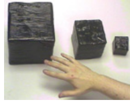
Figure 1b. Large, medium and small sized cubes.