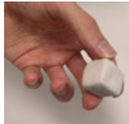
Figure 2b. One-handed finger manipulation.