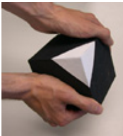
Figure 2c. Two-handed manipulation.