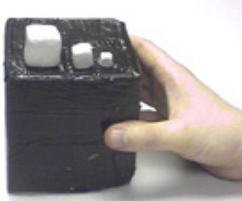
Figure 1a. Finger-sized cubes resting on a large cube.