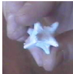
Figure 1d. Finger-sized star cube.