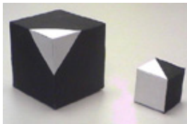
Figure 1e. Patterned cubes.