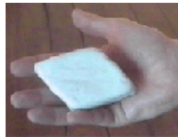
Figure 1f. Rhomboid.