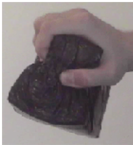
Figure 1c. Large-sized squishy cube.