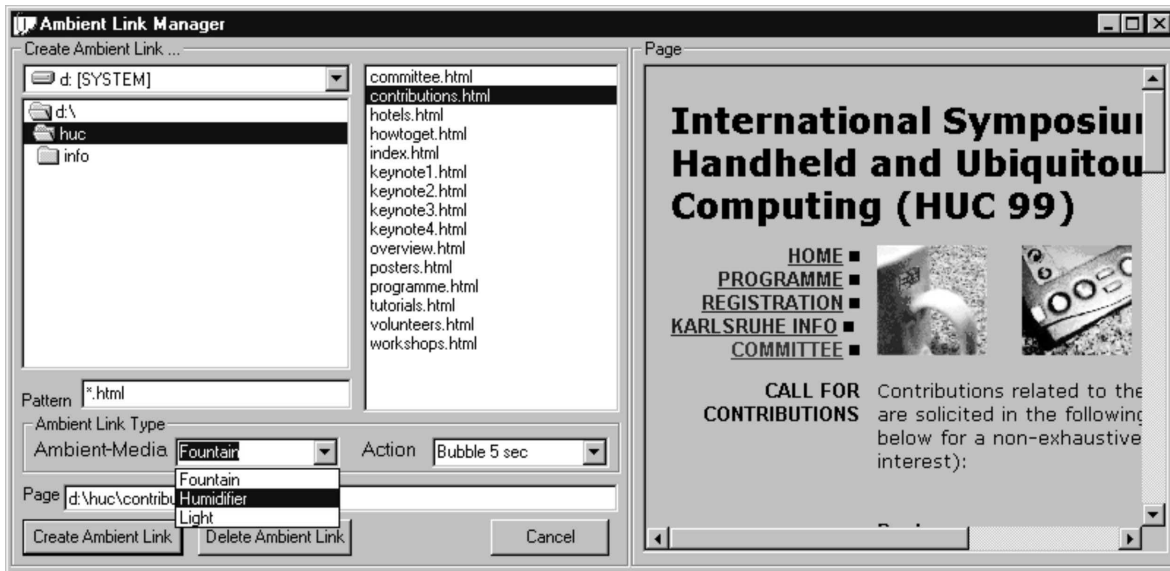
Figure 3: An editor for user controlled creation and deletion of ambient links between events in the web space and display effects in the physical work environment.

has been stressed that they provide a powerful alternative to desktop-based methods, as they do not compete for screen real estate and explicit user attention. This quality has also been exploited specifically for web visitor awareness in Liechti's system [9]. In previous published work we have added two concepts to the available body of work, ambient links and ambient counterparts [4]. Ambient links have been proposed to provide users with more control over the use of ambient displays to create their own web activity views dynamically. The notion of ambient counterparts has been introduced as foundation for activity views that support overview and comparison.