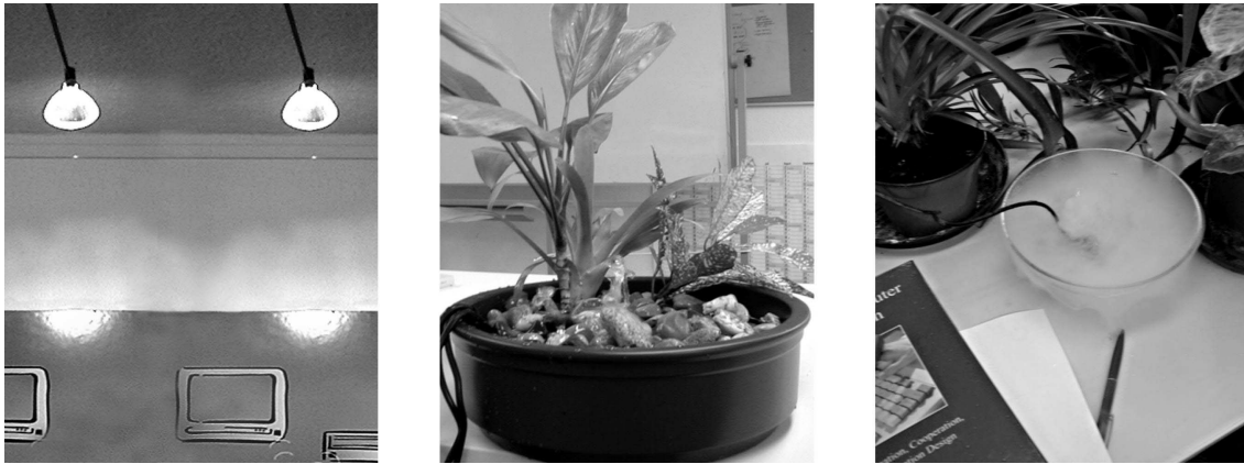
Figure 2: In our office environment, non-computer devices such as lamps, a table fountain and a humidifier are integrated as ambient media for display of web-based activity.