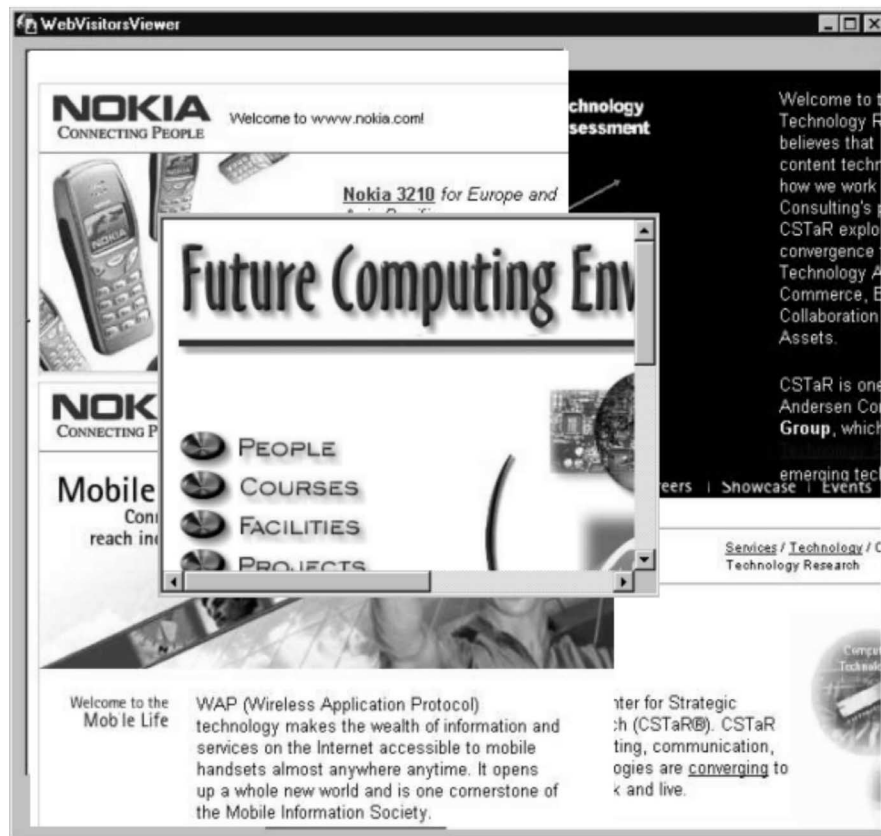
Figure 6: Glances into visitor's sites: this awareness display conveys at a glance from where a web site has been accessed recently

Overall, our experience suggests that glances into visitor's sites are a very useful and effective tool to support awareness within communities, as they guide web hosts to visitor's sites based on a notion of common interest. This introduces symmetry to the host-visitor-relationship, creating a situation in which both can learn from each other. However, implications will have to be investigated carefully, for instance with respect to privacy and intrusion (e.g. symmetry would invite self promotion by visiting others).